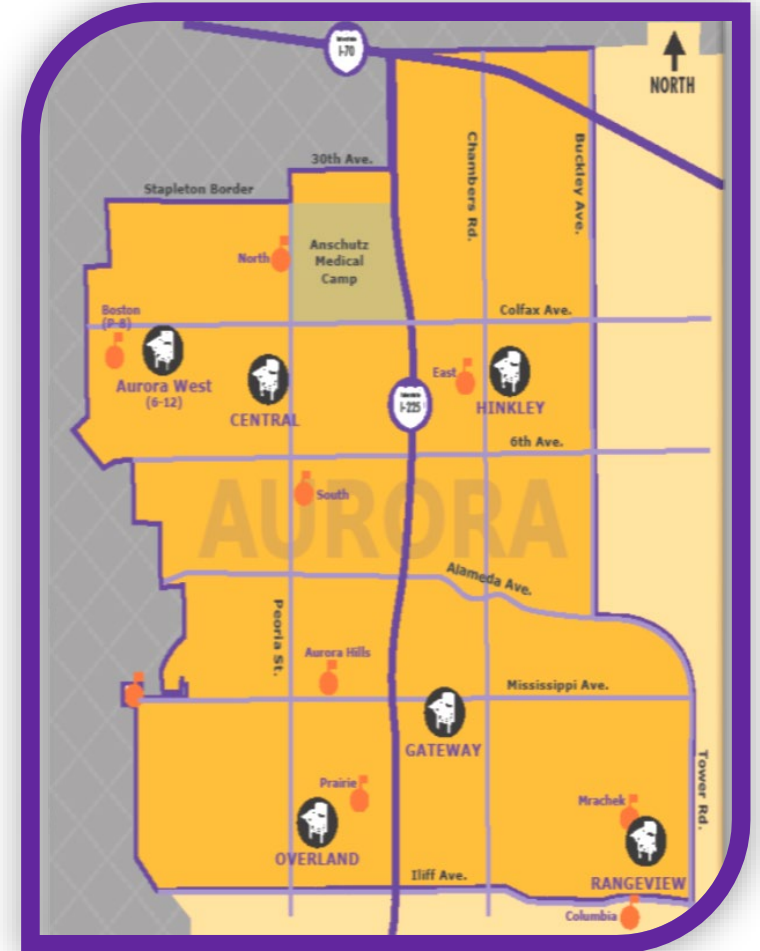
A-GRIP Target Area

Expand the gang-reduction plan to include strategies pertaining to juvenile re-entry